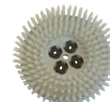
Nylon (white) - Standard scrub