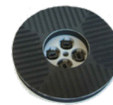
Pad drives (set of 3)